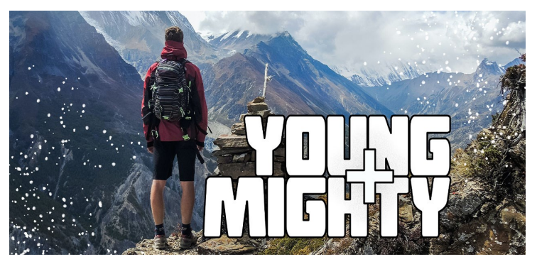
Doing The Impossible September 17 & 18, 2022